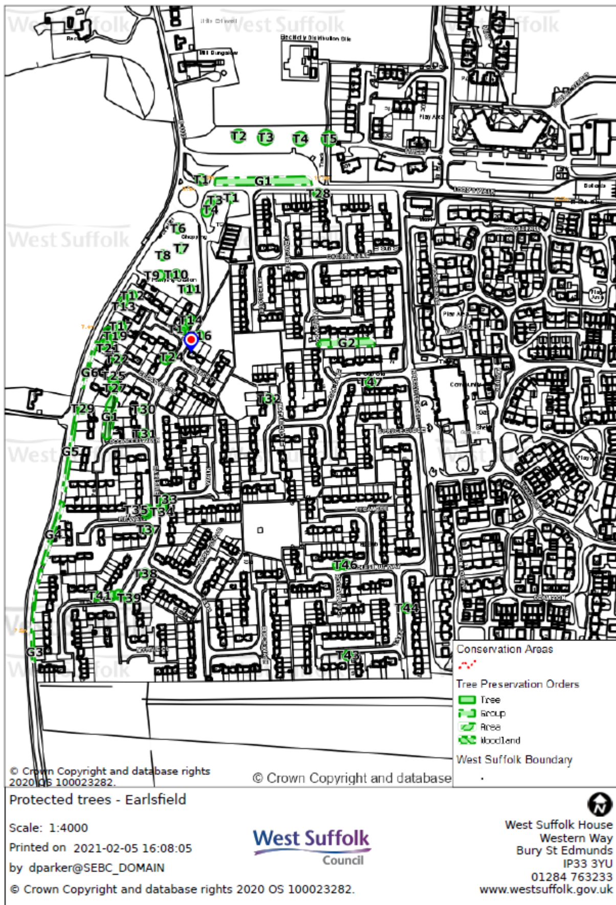
Protected trees at Earlsfield